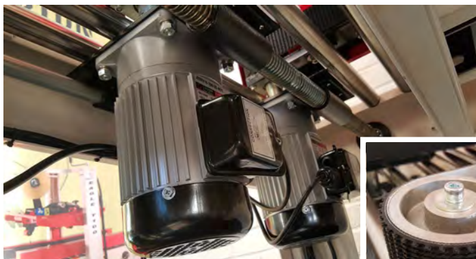
1/4HP Dual Industrial Motors